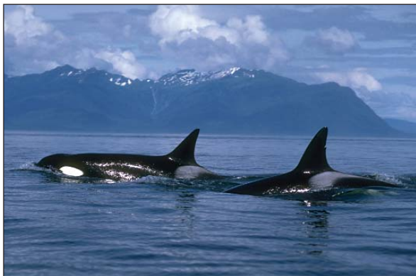
Alaskan collapse. Orcas turned to smaller prey when other whales were decimated by whaling after World War II.